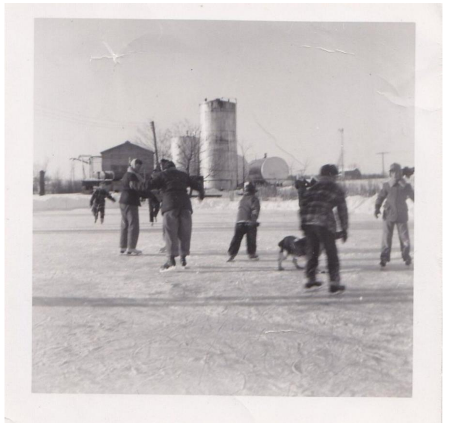
"WINTER ON DIRKS POND WITH THE GANG! LATE 1940'S"