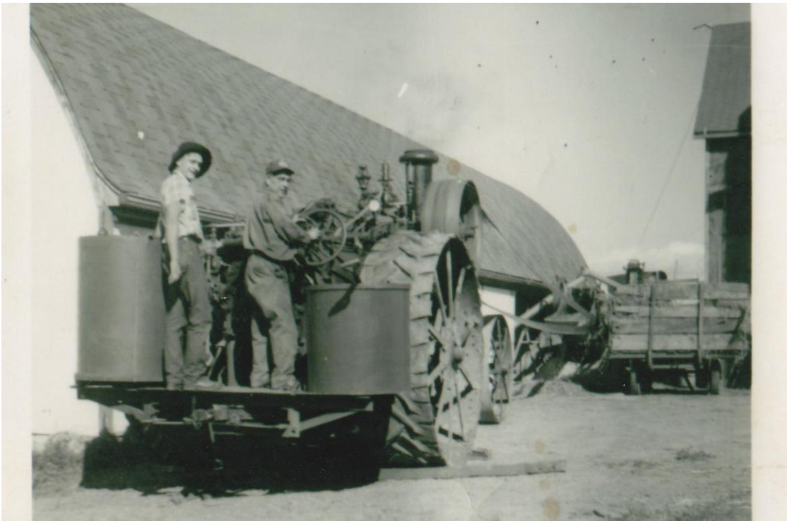
Minneapolis-Moline Steam Engine -1960